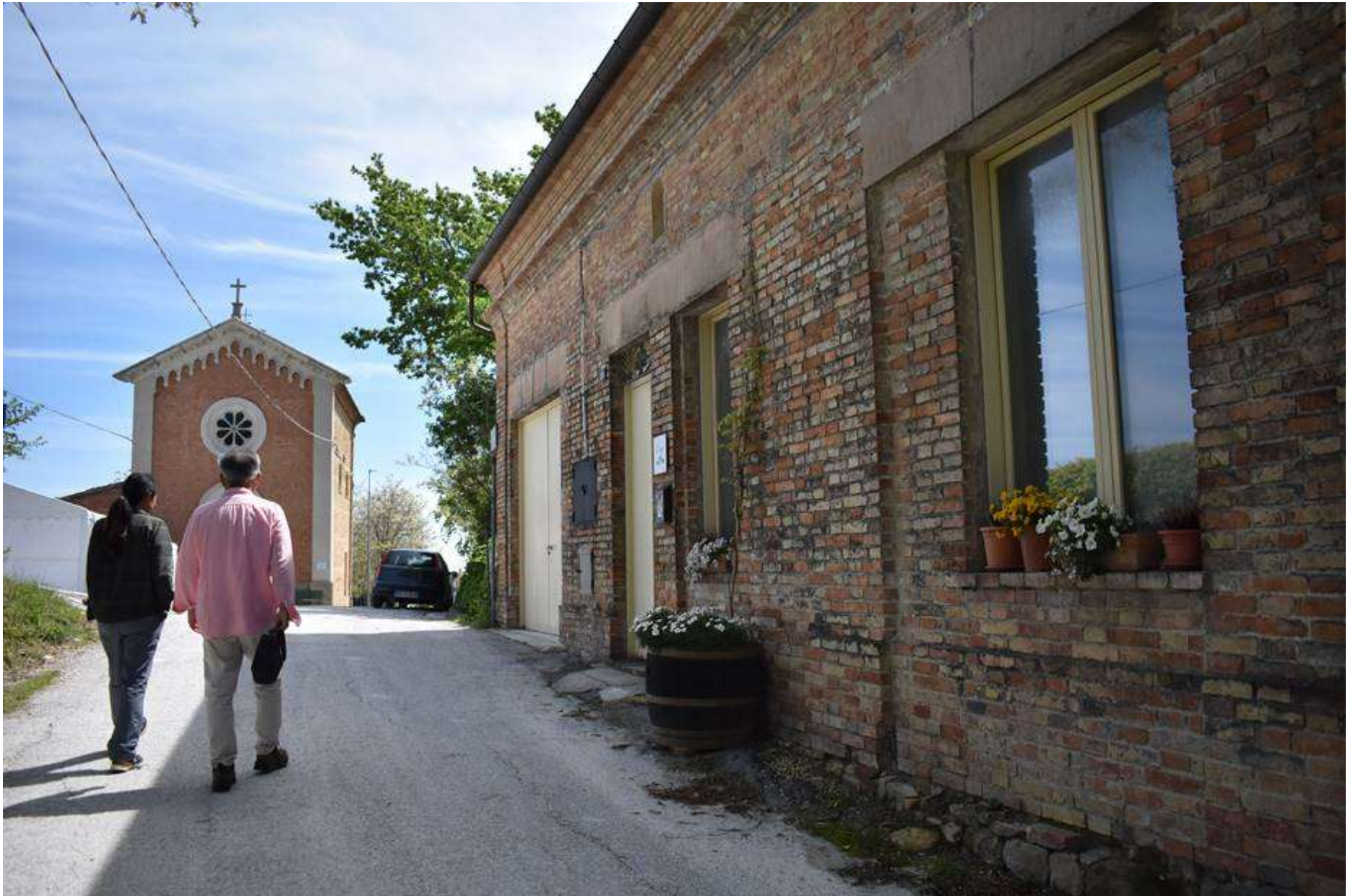
In the village of San Michele in Marche. La Distesa winery is the brick building to the right with a tiny church in the distance.